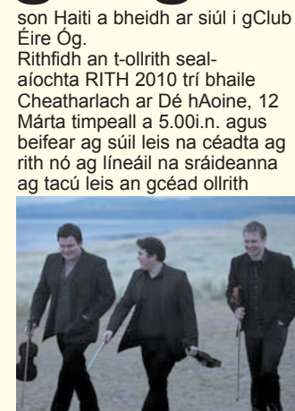
Beidh FIDIL i gCeatharlach do Sheachtain na Gaeilge