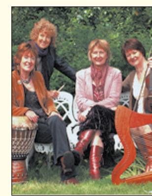
Cuirfidh Dordán ceolchoirm i láthair ins an Ostan Seven Oaks